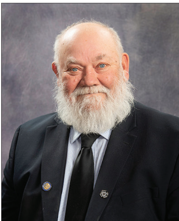
Sen. Denley Loge Montana State Senator Denley Loge (SD45)

The Missoula County Republican Central Committee (MCRCC) similarly censured Sen. Denley Loge, expressing frustration that he undermined the Republican Senate majority and prioritized personal and political considerations over conservative governance.