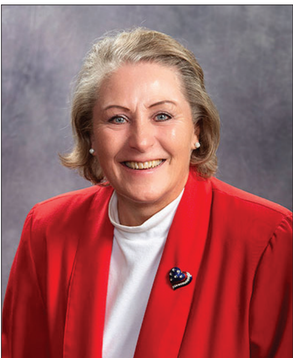
Sen. Shelley Vance Montana State Senator Shelley Vance (SD34)

The Gallatin County Republican Central Committee passed a formal censure of Sen. Shelley Vance, citing her repeated votes with Democrats that contributed to blocking Republican legislative priorities on issues such as judicial reform, election integrity, and limiting government. The Montana Sentinel first reported on the censure Saturday.